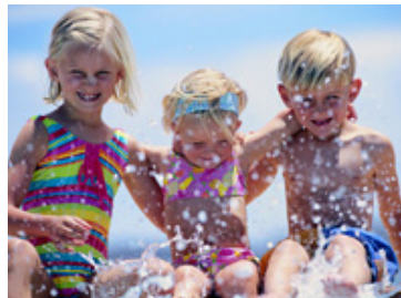
ZeoFiber is environmentally friendly, non-toxic and economical.

ZeoFiber is a blend of natural cellulose fibers that replaces diatomaceous earth in pool and spa filters. In D.E. filters, ZeoFiber replaces the D.E. and safely cleans pool water. In cartridge and sand filters, ZeoFiber works as a filter aid and improves water clarity.